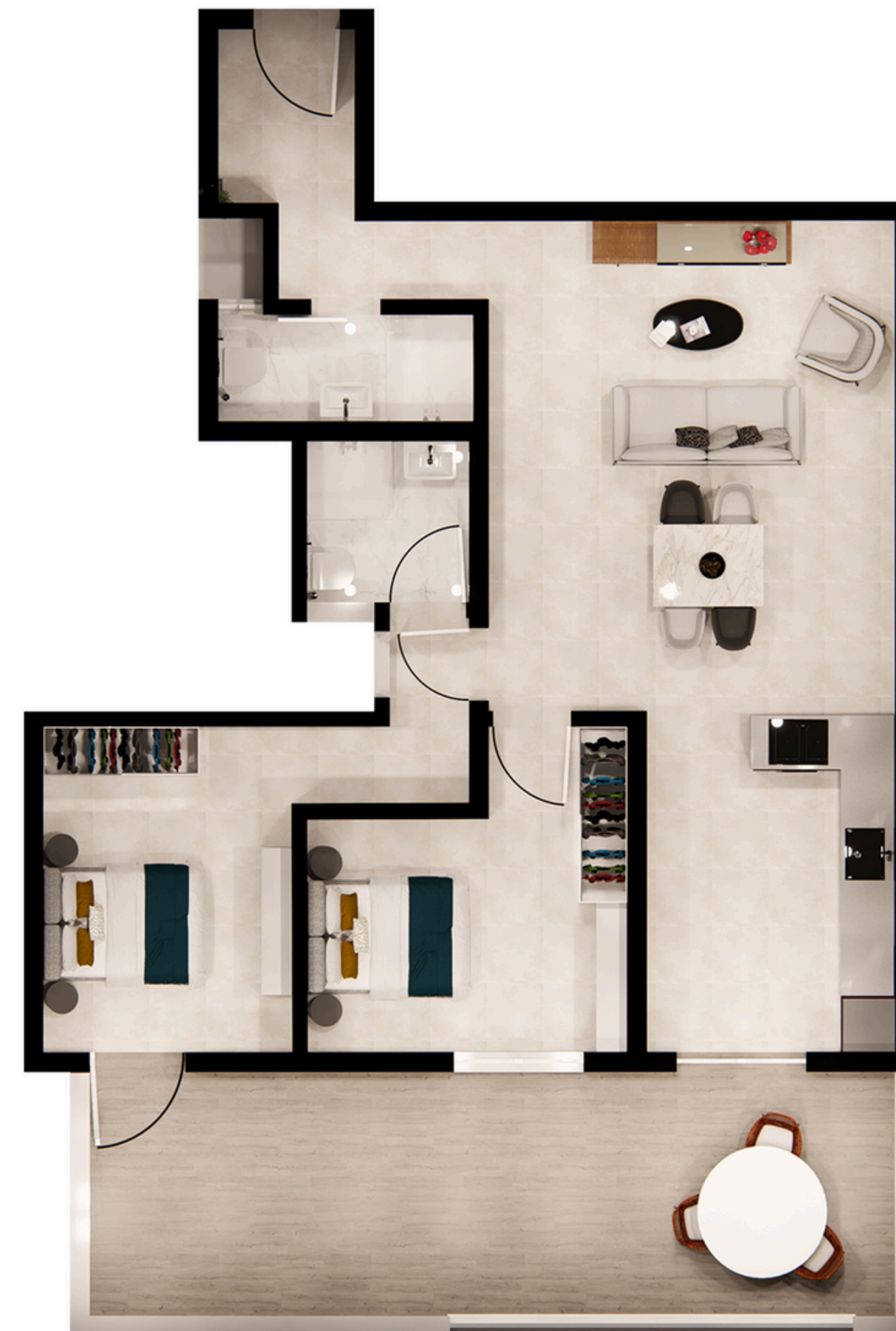
2 Bedroom Penthouse, The ARK, A12