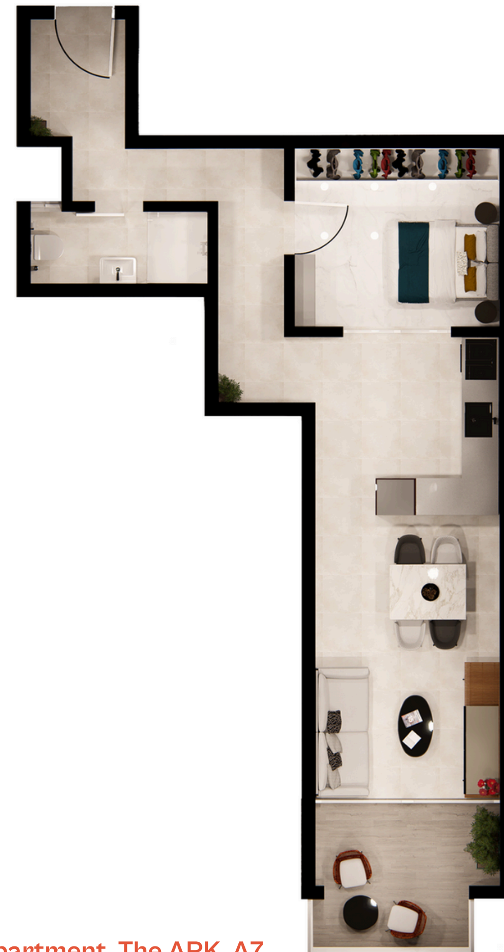
1 Bedroom Apartment, The ARK, A7