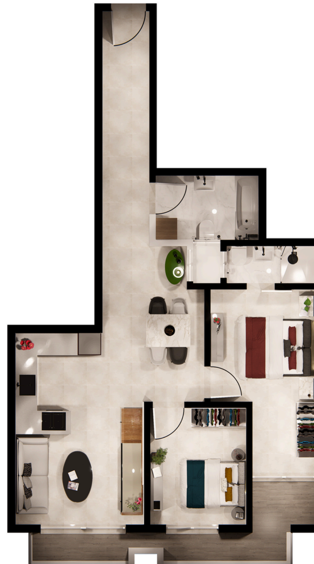
2 Bedroom Apartment, The ARK, A3